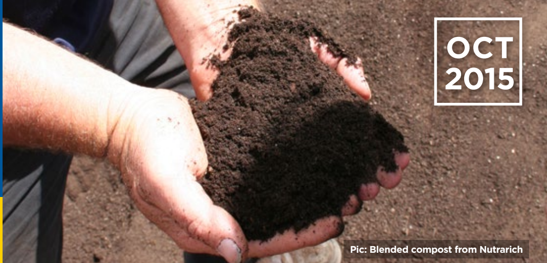
Pic: Blended compost from Nutrarich