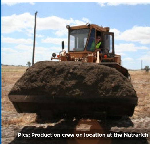
Pics: Production crew on location at the Nutrarich processing facility in Brookton.

Have you ever considered what actually happens to your rubbish once it leaves your vergeside collection? We have been filming a new video to provide a closer look at the journey items undergo in the resource recovery process. Using a combination of equipment, including GoPro cameras and drone videography, the footage will give a unique view of the Materials Recovery Facility, the Green Waste Facility and the Waste Composting Facility. The video also includes Nutrarich's processing facility in Brookton where RRRC's compost is blended for agricultural use. The film will be available for viewing shortly on our website.