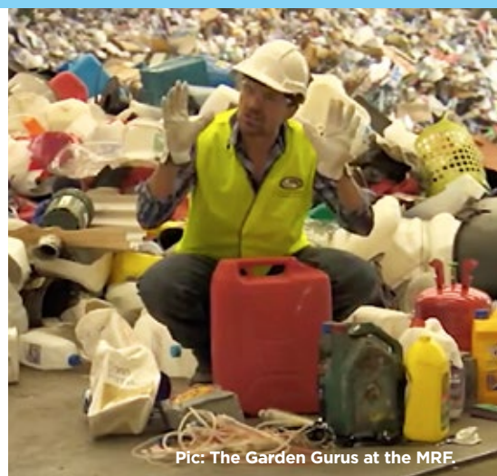
Pic: The Garden Gurus at the MRF.

To view the episodes, visit: recycleright.wa.gov.au/recycle-right-on-garden-gurus-tv-2015/