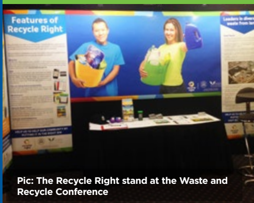
Pic: The Recycle Right stand at the Waste and Recycle Conference