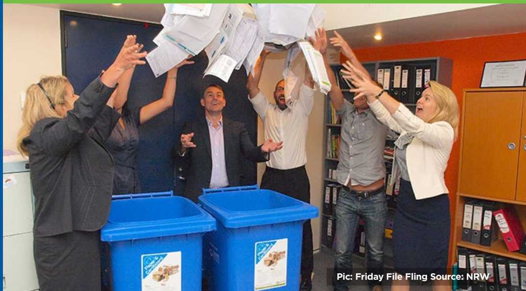
Pic: Friday File Fling

National Recycling Week (NRW) 2015 runs from 9 to 15 November.