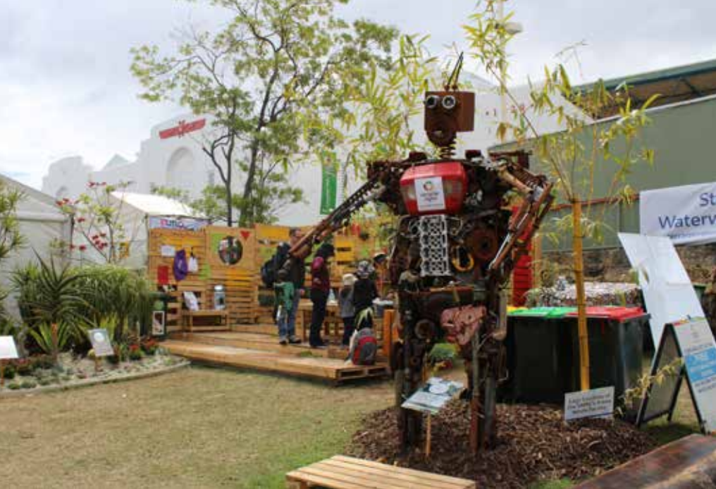
The Recycle Right Robot in Trevor Cochrane's Waterwise Garden