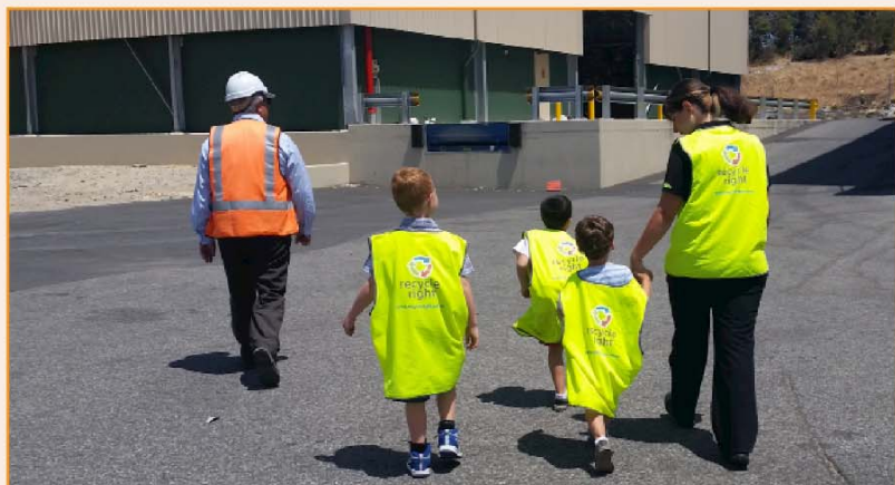
Photo: A group of young visitors enjoying a tour

The Recycle Right Tour Guides can provide your school, community group, family and friends with a fantastic tour of the Regional Resource Recovery Centre in Canning Vale. The tour takes 1.5 to 2 hours and includes a stroll through the conservation area, the Waste Composting Facility, Audit and Green Waste Facilities and finishes in our state-of-the-art Materials Recovery Facility Education Centre.