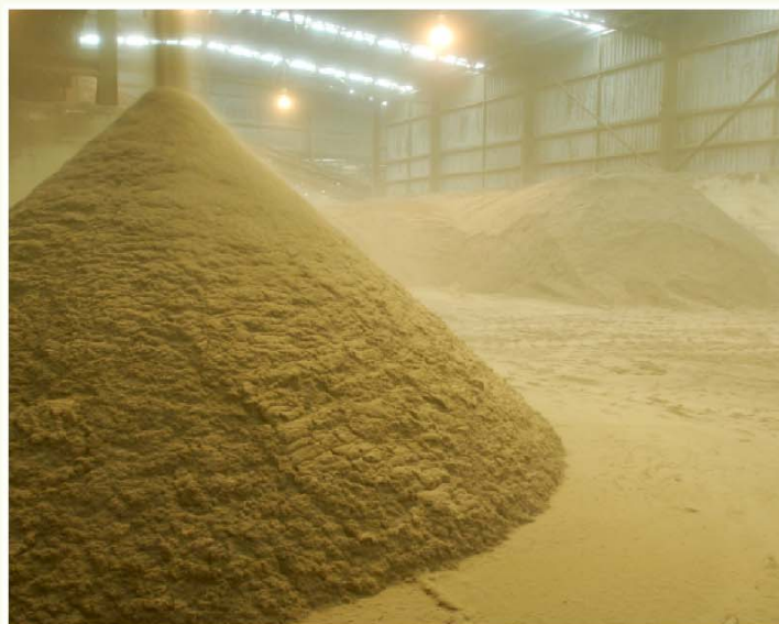
Photo: Inside the Waste Composting Facility