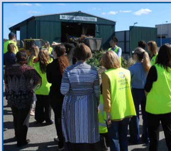
Image: City of Melville staff outside the Green Waste Processing facility