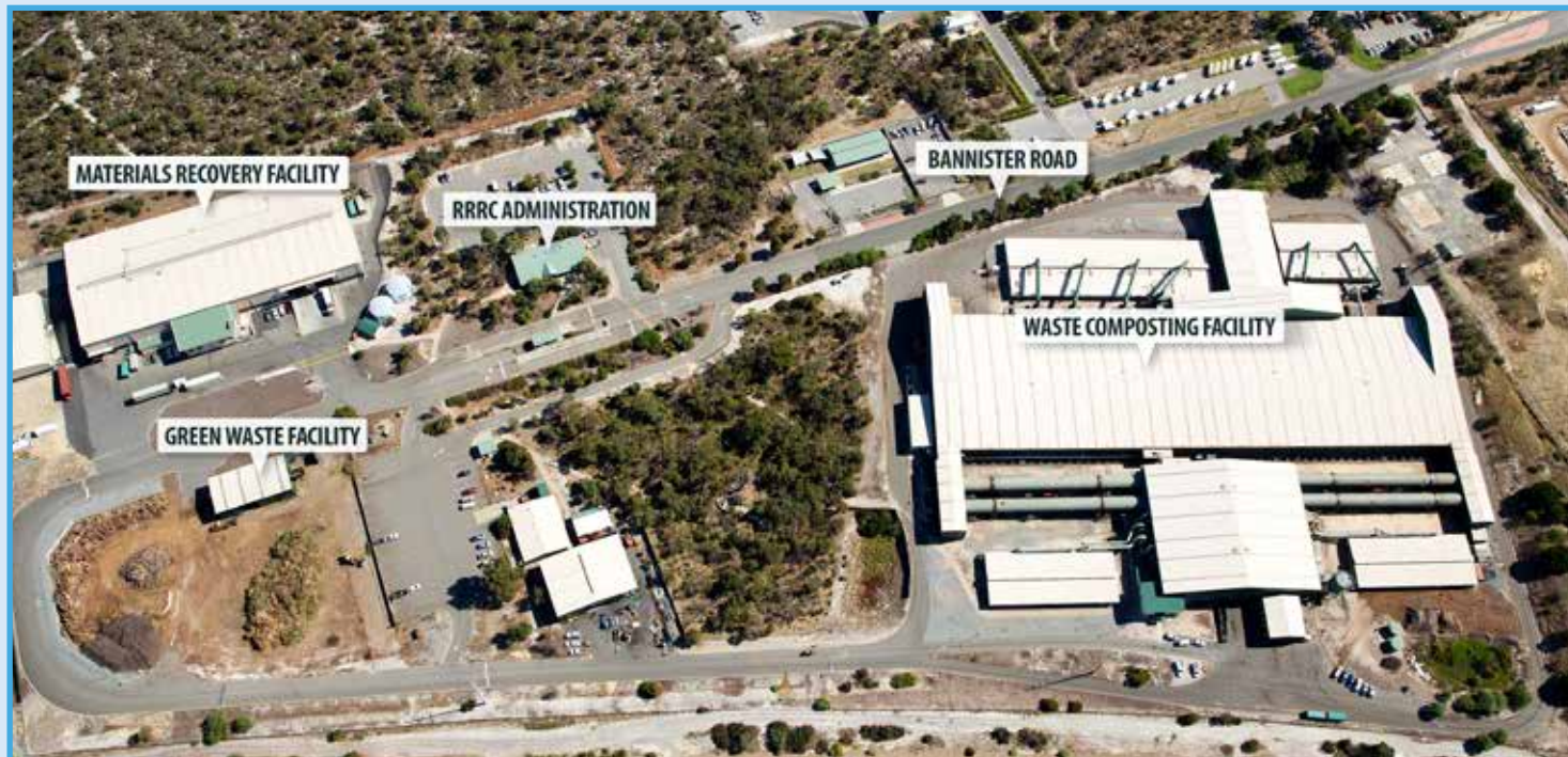
Image: The RRRC Canning Vale site

The SMRC recently commissioned updated aerial photographs of the RRRC site. The photo below demonstrates the scale of operations.