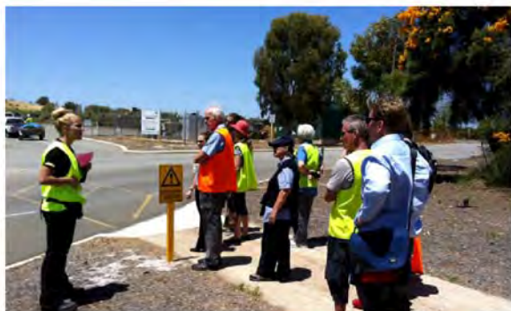
The Cockburn community tour on their way around the Regional Resource Recovery Centre.

If you would like to tour the Regional Resource Recovery Centre please see the details below on tours.